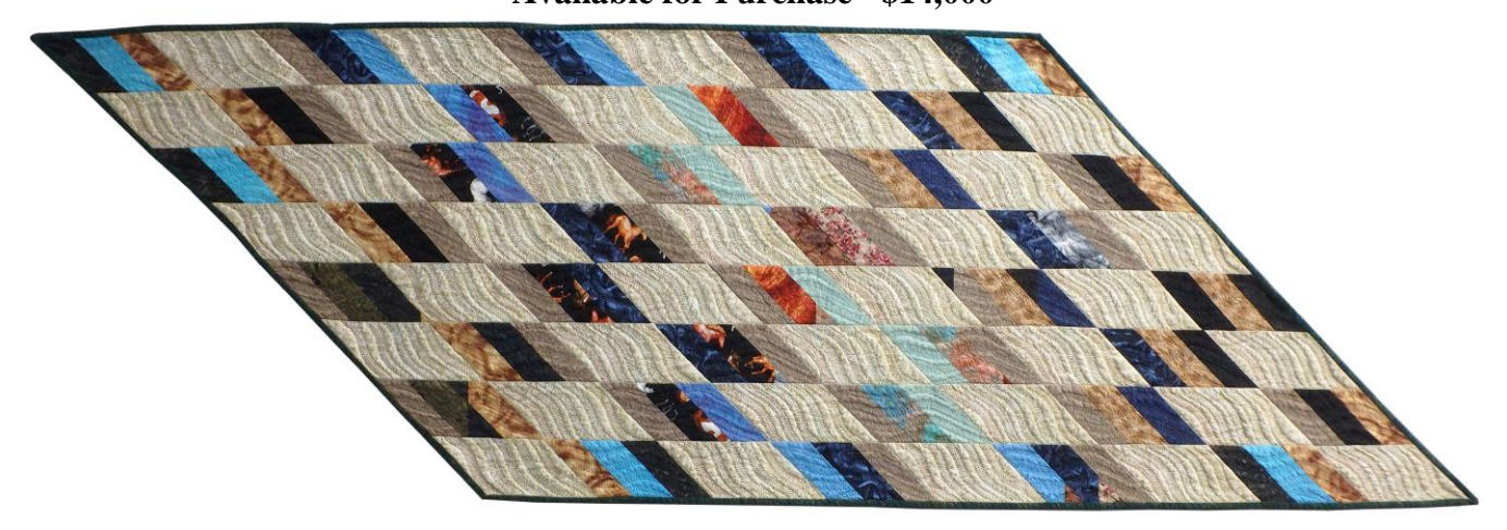
Exhibition and Publication History

(c) 2013-2021 Jean M. Judd/Artists Rights Society (ARS) New York Hand Stitched Thread on Textile **Available for Purchase - $14,000**